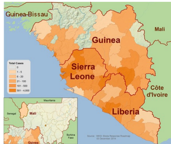
Above: Countries affected by the 2014 West African Ebola epidemic.