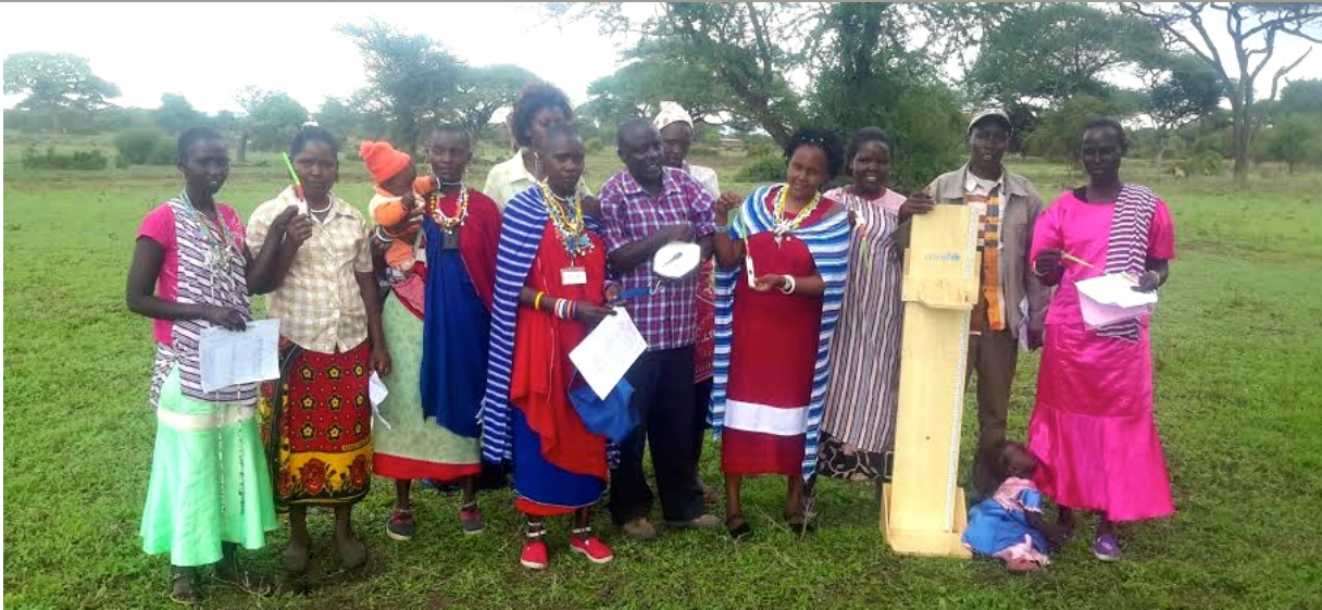
Above: Community health workers are currently being trained for the Meliyio project and will soon begin screening children.