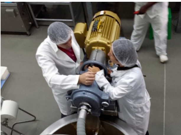
Below: External consultants and Malawi factory staff collaborate to install a brand new piece of equipment (story on pg. 4).

In November, the group received official approval from the district public health officer to start the project in Rombo, and the district health center is showing great support and excitement for the project. Community health workers are currently being trained and will soon begin to screen children. Project Peanut Butter is thrilled to hear that the most effective care for malnourished children is catching on in Kenya and cannot wait to receive updates on this new project from the Orione Community Training Center. ♦