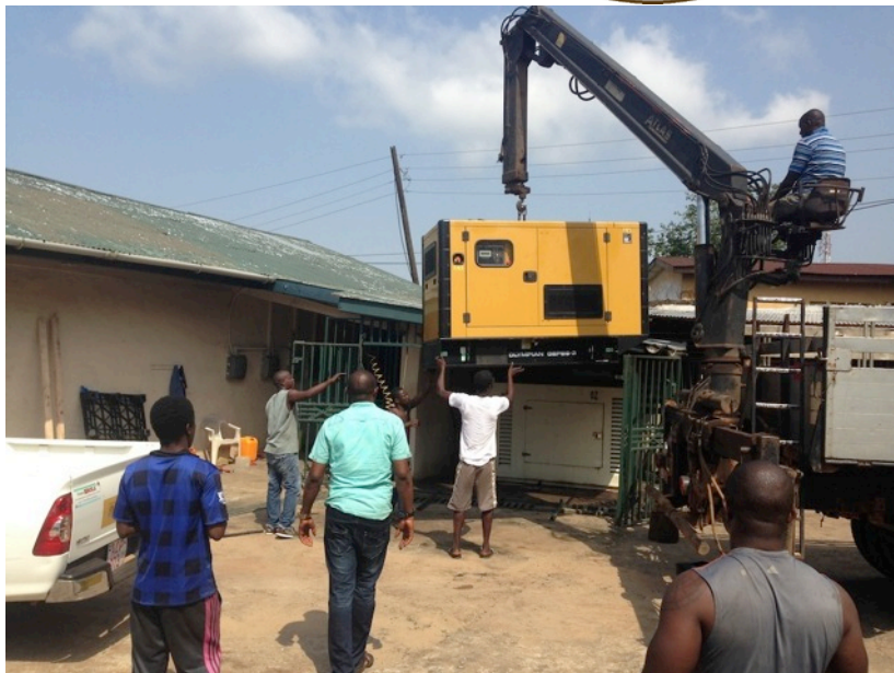
Above: Sierra Leone receives new generator from Sweet Harvest Foods.