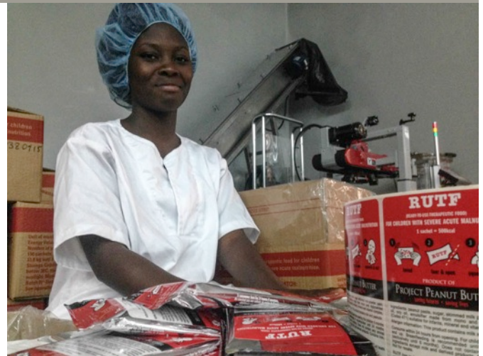
Above: PPB Ghana production staff package RUTF Below: CMAM training in Atebubu district

PPB Ghana hopes to collaborate with the World Food Program to produce a RUSF for moderately malnourished kids.